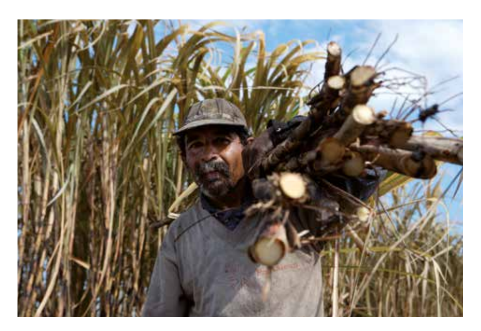
Above: Harvesting sugar cane by hand at the Belize Sugar Cane Farmers Association.

"...FAIRTRADE CONTRIBUTES TO REINFORCE THE BEST MANAGEMENT PRACTICES WITHIN THE INDUSTRY AND ALSO THE INTRODUCTION OF MORE STRINGENT RULES WITH REGARDS TO THE GOVERNANCE OF COOPERATIVE SOCIETIES."